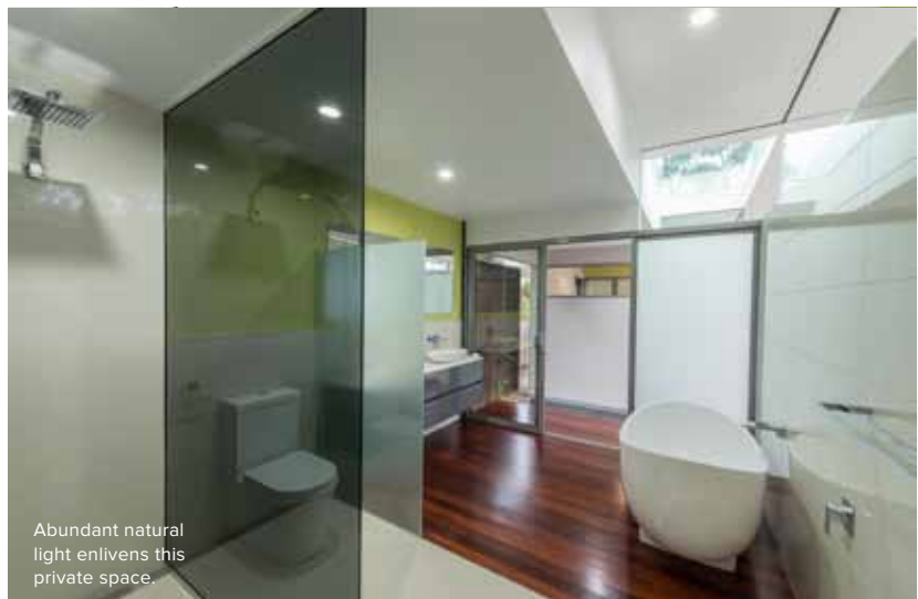
Abundant natural light enlivens this private space.