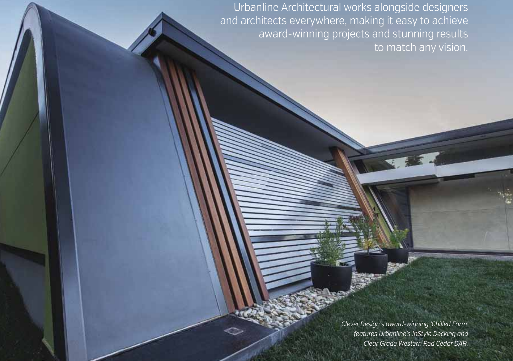
Clever Design's award-winning 'Chilled Form' features Urbanline's InStyle Decking and Clear Grade Western Red Cedar DAR.

Urbanline Architectural works alongside designers and architects everywhere, making it easy to achieve award-winning projects and stunning results to match any vision.